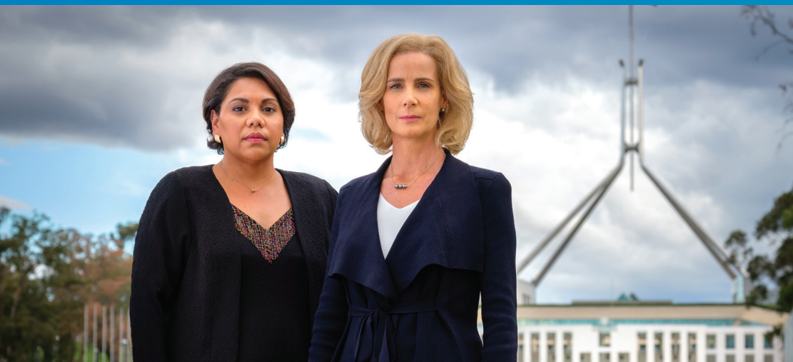
Deborah Mailman and Rachel Griffiths in Total Control .